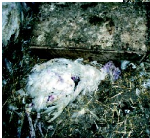
This turkey (pictured while still alive top left) lay down and died next to a rat bait box

'THE CHRISTMAS TURKEY' video showing exactly what we found on this farm. Perhaps you could show your friends or even make an appointment to show your local TESCO manager for his comments. It is only because people buy these products and cause a demand, that there is so much animal suffering to produce the supply!