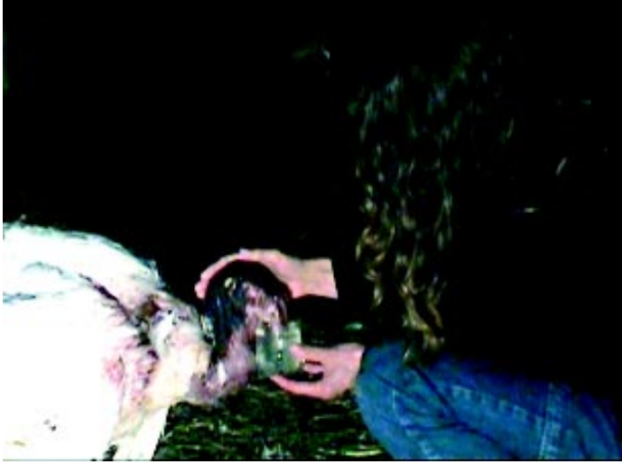
Giving water to the suffering and dying, being in the presence of these helpless birds, always brings home to me the grim reality of the plight of millions of others in Britain's heartless farming industry.