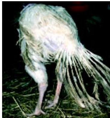
Many turkeys have swollen joints. At slaughter these heavy birds are hung upside down by painful legs before reaching the stunner.