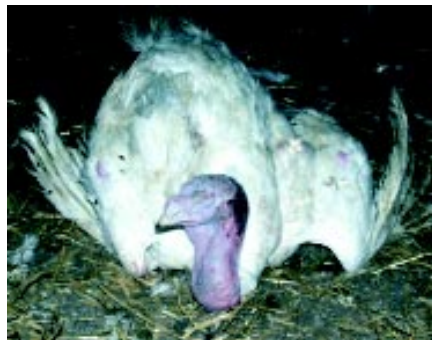
Unable to walk, this turkey is dragging itself along by its wings

"This is to certify that on 12th September 2003 I examined a white turkey brought to me by Hillside Animal Sanctuary. It appeared unkempt with scabs to the top of its head and neck and it carried its left leg and was unable to move around freely. The leg appeared to be malformed but not dislocated. The bird was euthanased on welfare grounds."