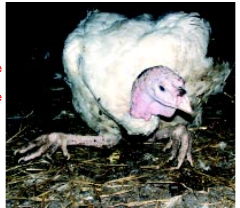
Many crippled and deformed birds struggle to get to food and water