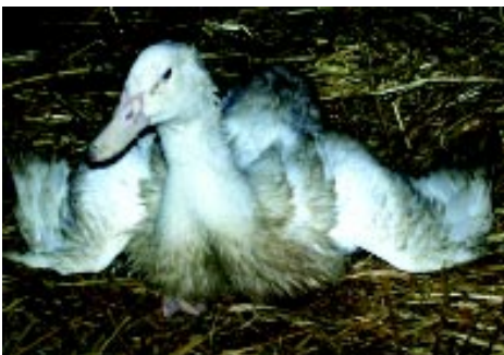
... using his wings as crutches

Hillside Investigation Video/DVD Ducks in Despair shows the conditions that ducks in this investigation had to endure just days before an RSPCA visit.