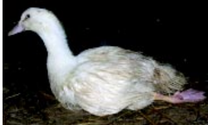
... dragging a broken leg

*To further expose the suffering of factory-farmed animals, we have been working with the BBC who have filmed ducks being reared on a different Kerry Food's site at Little Ellingham in Norfolk. This was shown on the investigation programme 'Inside Out' in September 2004. You can see this broadcast by ordering our FREE video or DVD, Ducks in Despair , from the Gift Shop page on this web site.